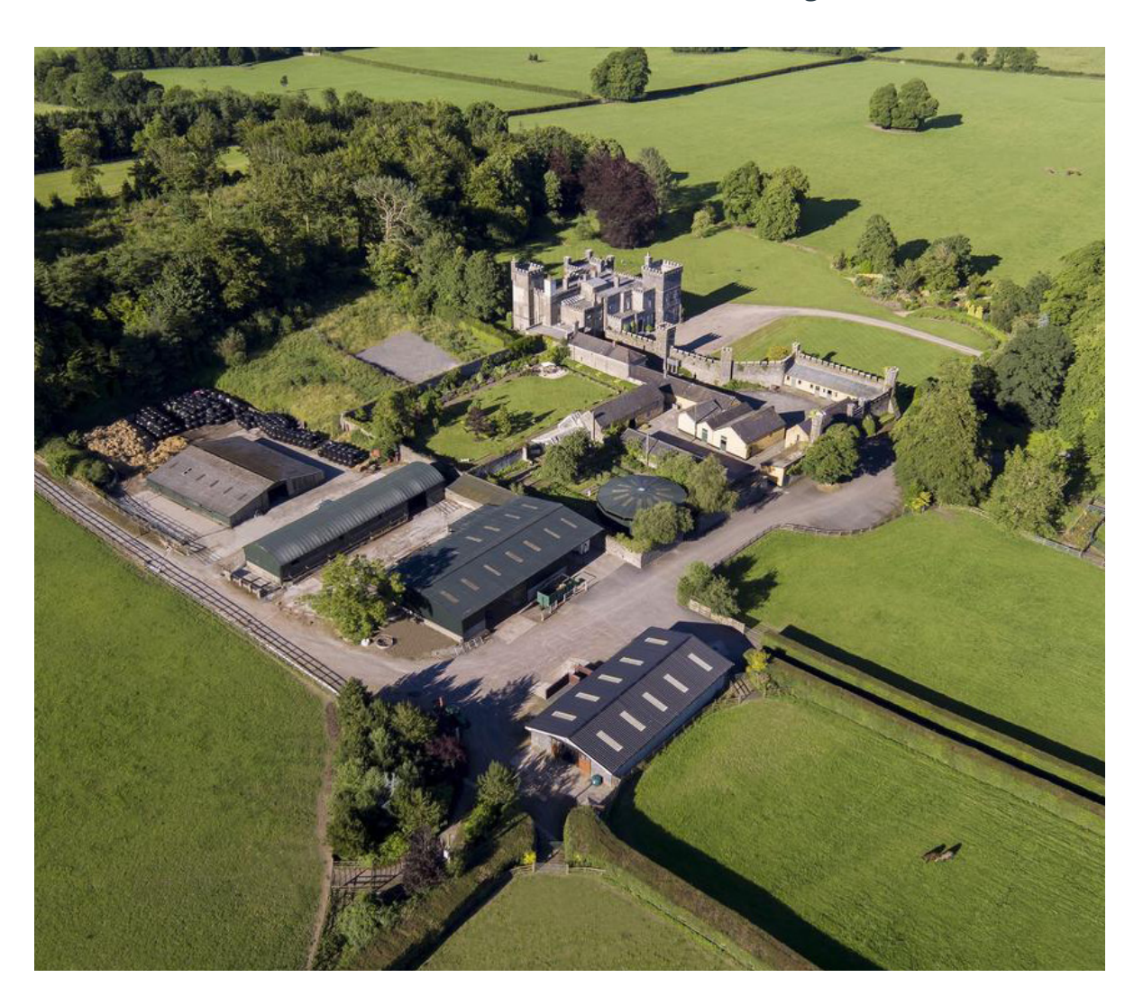
The Wilton Group, 26 Grosvenor St. Mayfair, London W1K 4QW www.wiltongroup.com

Within the property you can find ground floor reception rooms, and a comm dious and airy library. The broad oak staircase in the main hall leads to five bedrooms overlooking the gardens, fields and the famous peak of Slievenamon. There are another two bedrooms and attic rooms accessed through additional stairs.